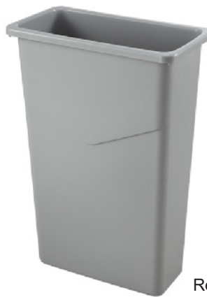
Recycling polyethylene container