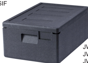
JW-EPP160 JW-EPP180 JW-EPP400