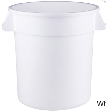
White polyethylene container