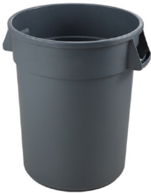
Black polyethylene container